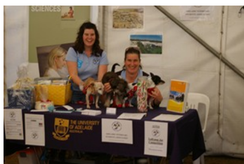
AVSA Stall at Million Paws Walk at Elder Park