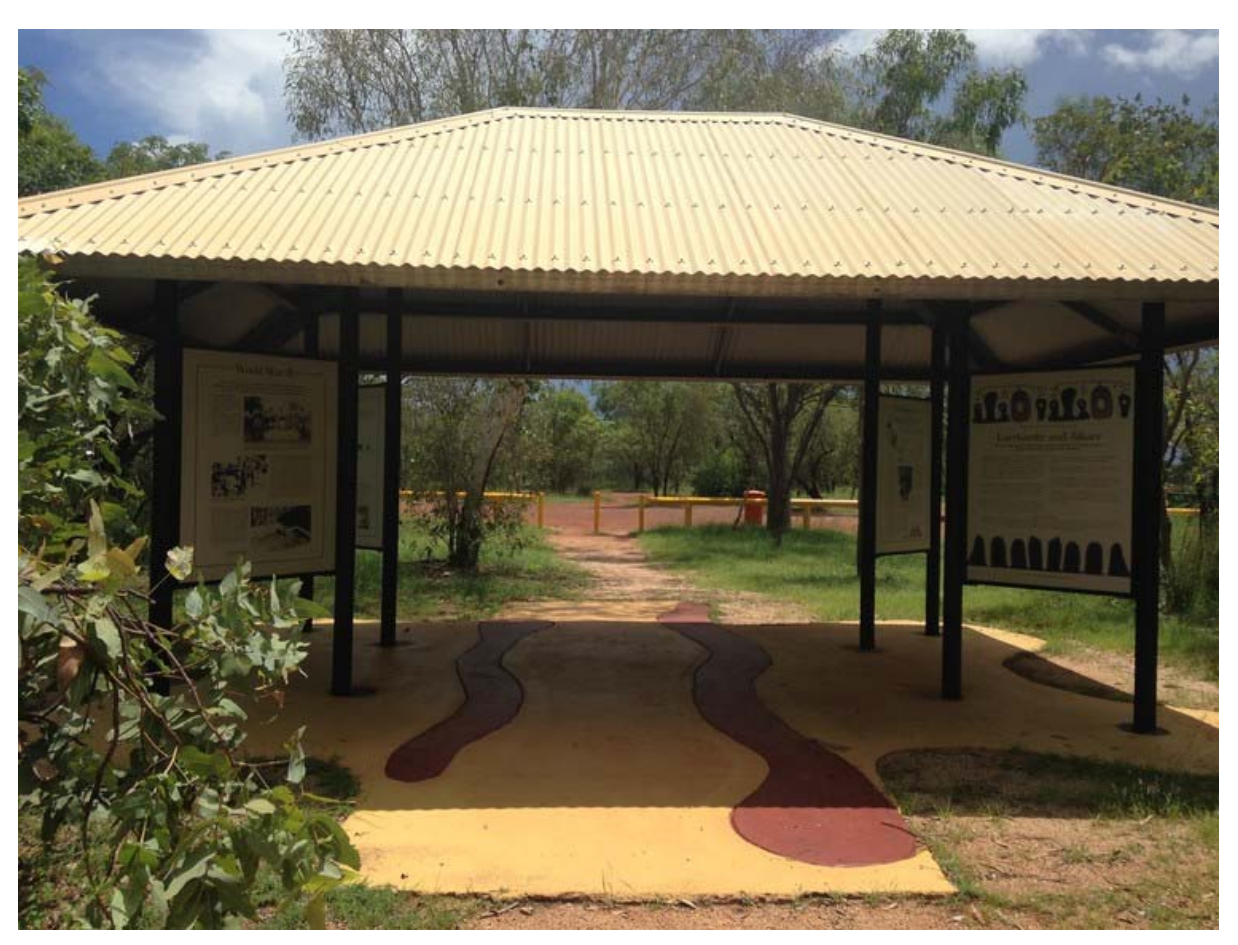
An information board telling the 'history' of the tree.

It fails to tell of the insurgences, resistance and resilience of Aboriginal people, portraying them as passive prisoners. Aboriginal people in the Kimberley were criminalised, disenfranchised and dehumanised in the invasion of their land.