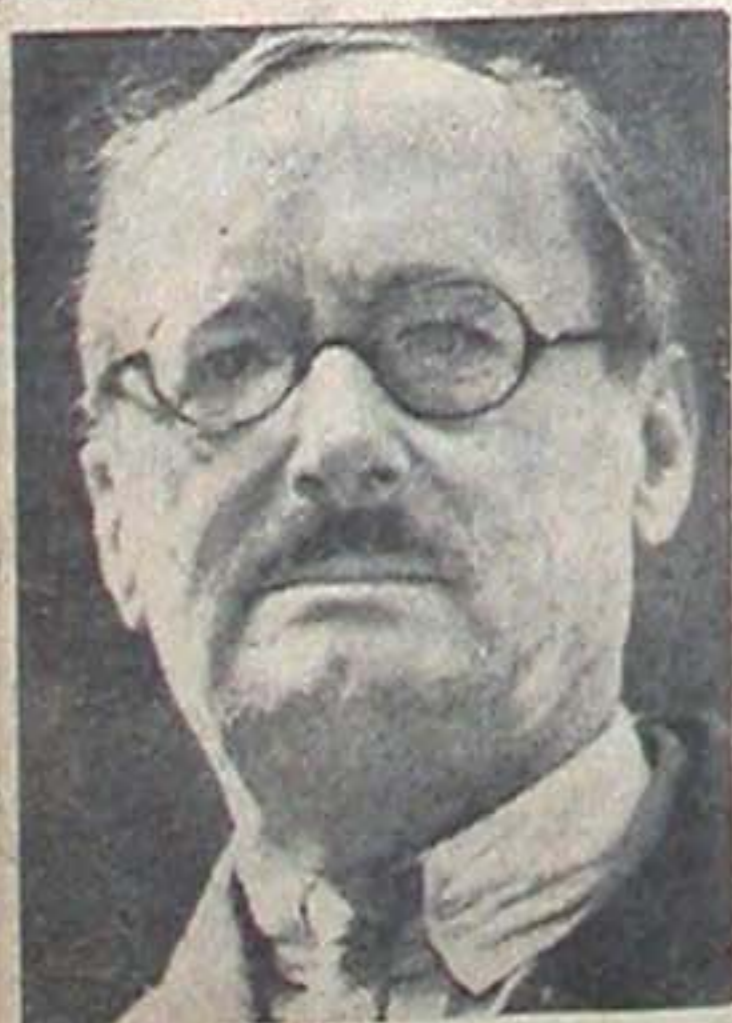
LORD HORDER, physician to the Prince of Wales, photographed in Melbourne, where he is attending the British Medical Association Congress. He is in charge of the medicine section of the congress.