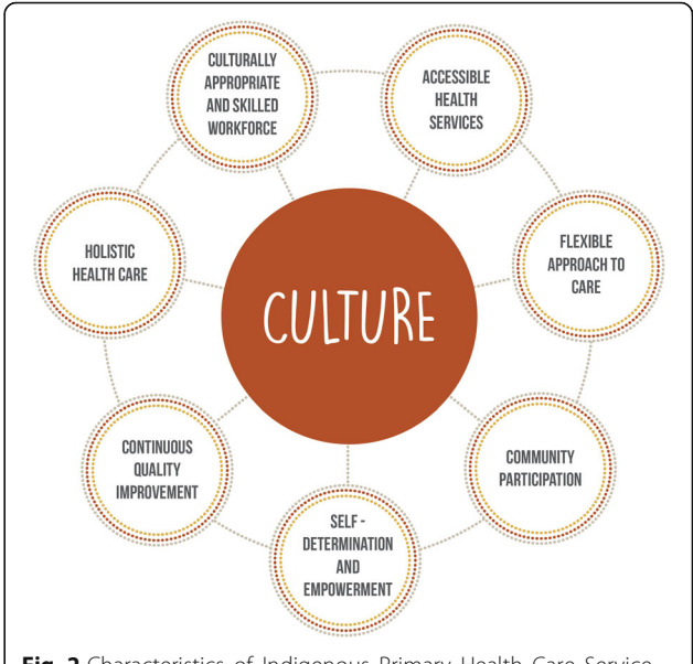
Fig. 2 Characteristics of Indigenous Primary Health Care Service Delivery Model

The aim of this scoping review was to identify the characteristics of Indigenous PHC service delivery models. We found that culture underpinned all aspects of the Indigenous PHC service delivery models identified in this review. In addition, we identified seven other distinct characteristics of Indigenous PHC service delivery models – accessible health services, community participation, continuous