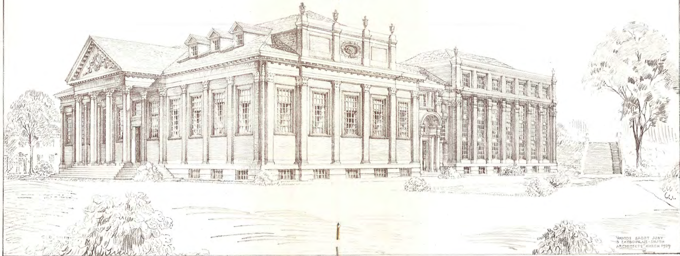
The Barr Smith Library: Original Project for Completed Building